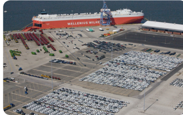
Image: Southampton Terminal