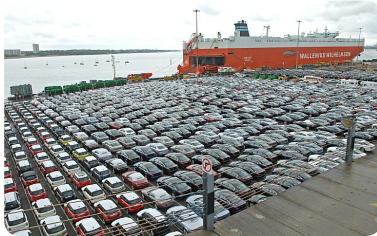
Image: Baltimore Terminal