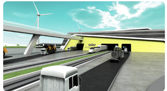
Image: Castor Green Terminal Concept

We believe that the Castor Green Terminal will make sustainable intermodal solutions not only viable but preferred by our customers and all those who participate in port activities.