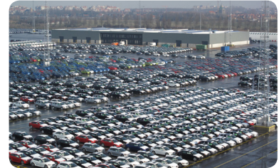
Image: Zeebrugge Terminal